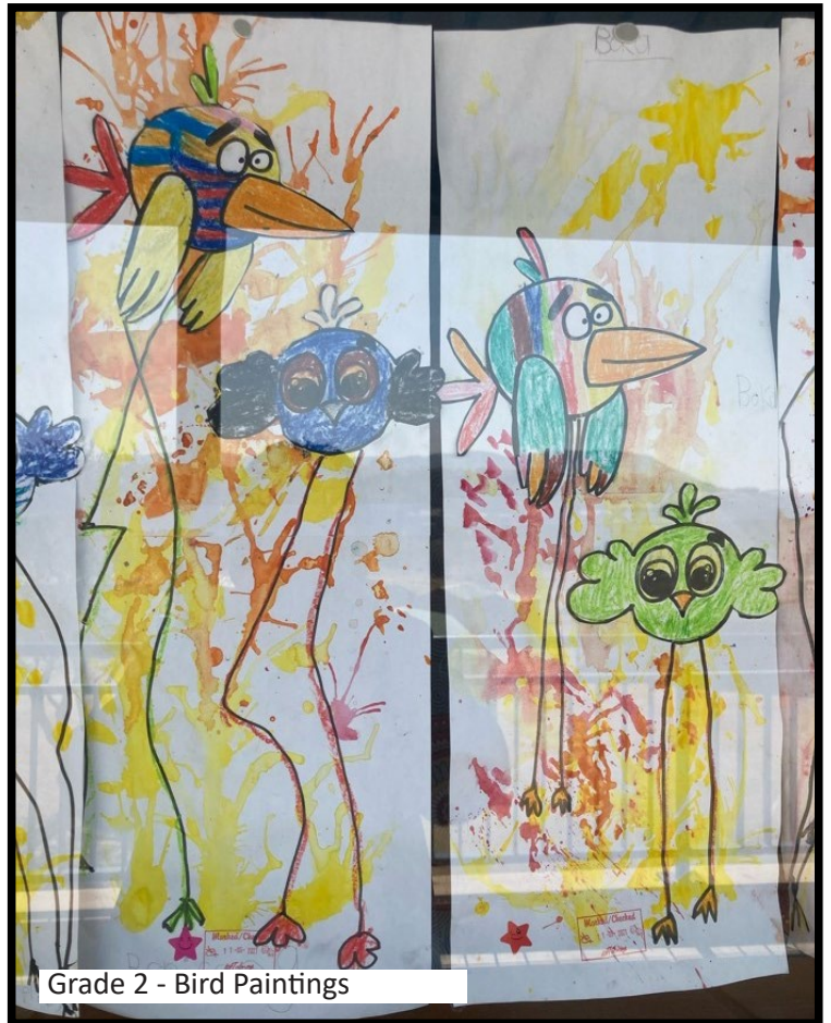
Grade 2 - Bird Paintings